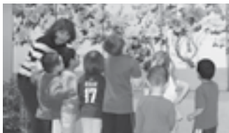
Mount Pleasant Neighborhood House

Cost: $1/session, registration through MPCC