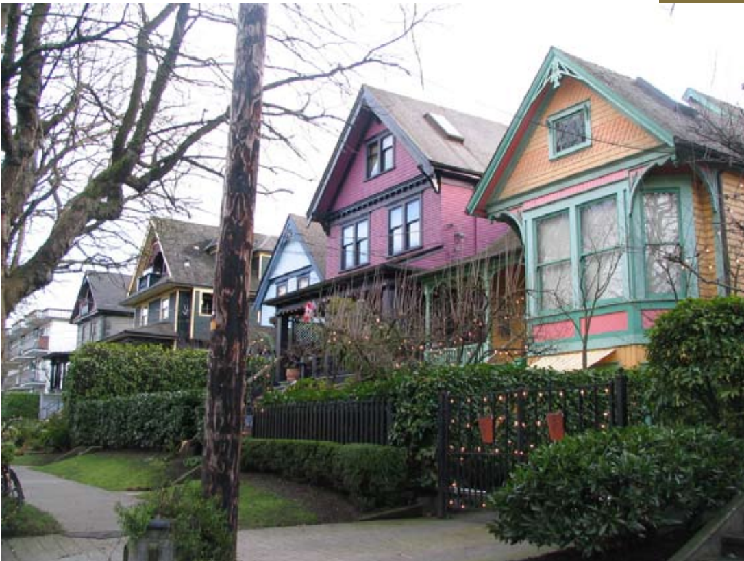
Five Davis Houses

In 1973 four members of the Davis family did something seemingly ordinary today, but quite unusual for the time. They purchased and began renovating a very old and deteriorated house on 10th Avenue in West Mount Pleasant. Research revealed it to be the oldest known house in Mount Pleasant, and