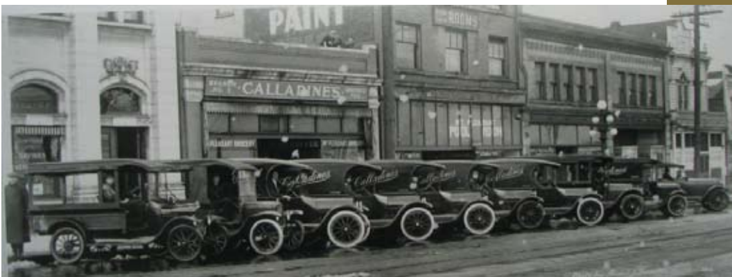
The 2300 block of Main Street between 8th and 7th Avenue looking pretty much as it does today. This picture was taken before 1922, when people still drove on the left side of the road as they still do in Great Britain. From the left, the Royal Bank, Calladines, the Mount Pleasant Pool Hall, McCallum's hardware store and on the far right, the 1892 Clark Building.