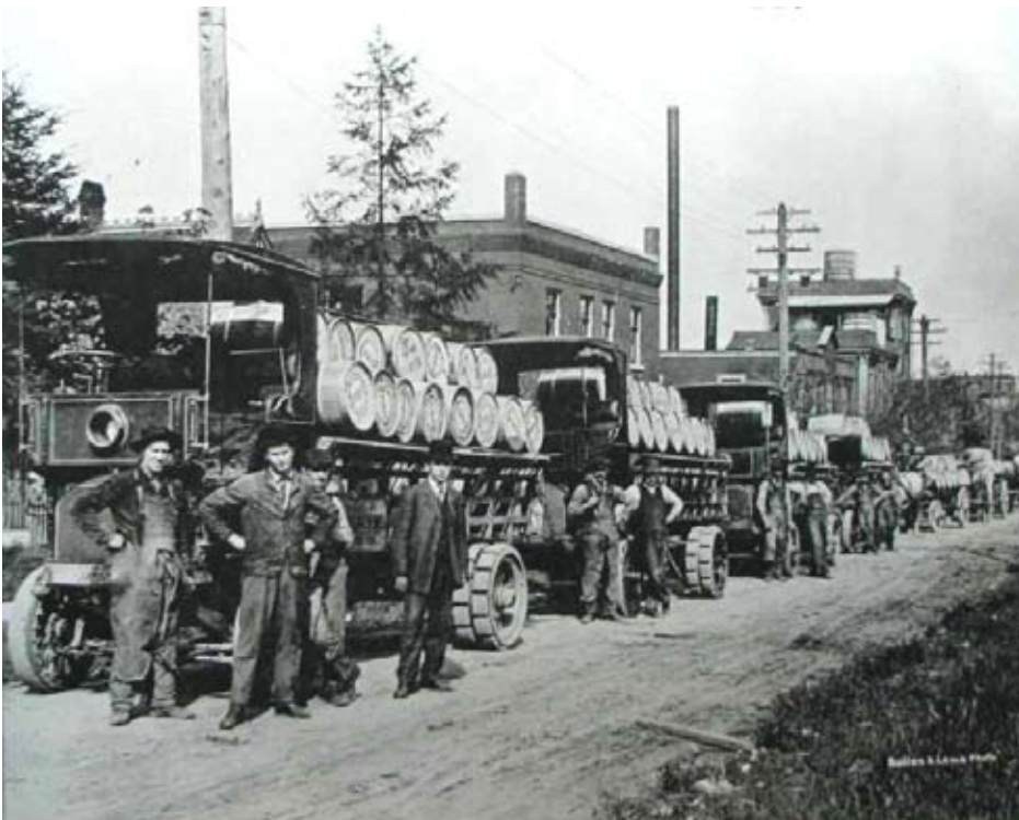
The Vancouver Brewery on 7th Avenue just east of Main Street with its new fleet of delivery trucks in 1910